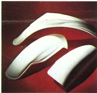
White light-weight fenders in crash-proof ABS-plastic.

Today's rider is a well trained athlete. He demands a machine with potential to match his ability. The Husqvarna 125 fills this demand — whether on the trail, desert or the toughest motocross course. It has been that way with Husqvarna for 70 years.