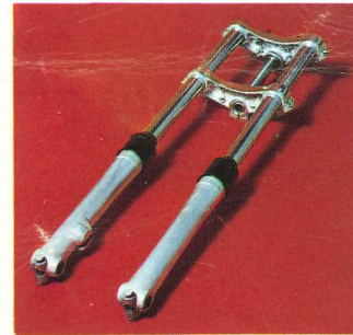
Betor light-weight telescopic front fork. Fork crowns of forged light alloy.