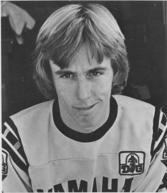
Bob Hannah . . . The first of three DG riders to graduate to Yamaha Factory Race Team status. Now one of the world's most prominent riders, Bob took the NUMBER 1 PLATE in the 1977 AMA Supercross Series.

DG is proud of these distinguished race team alumni!