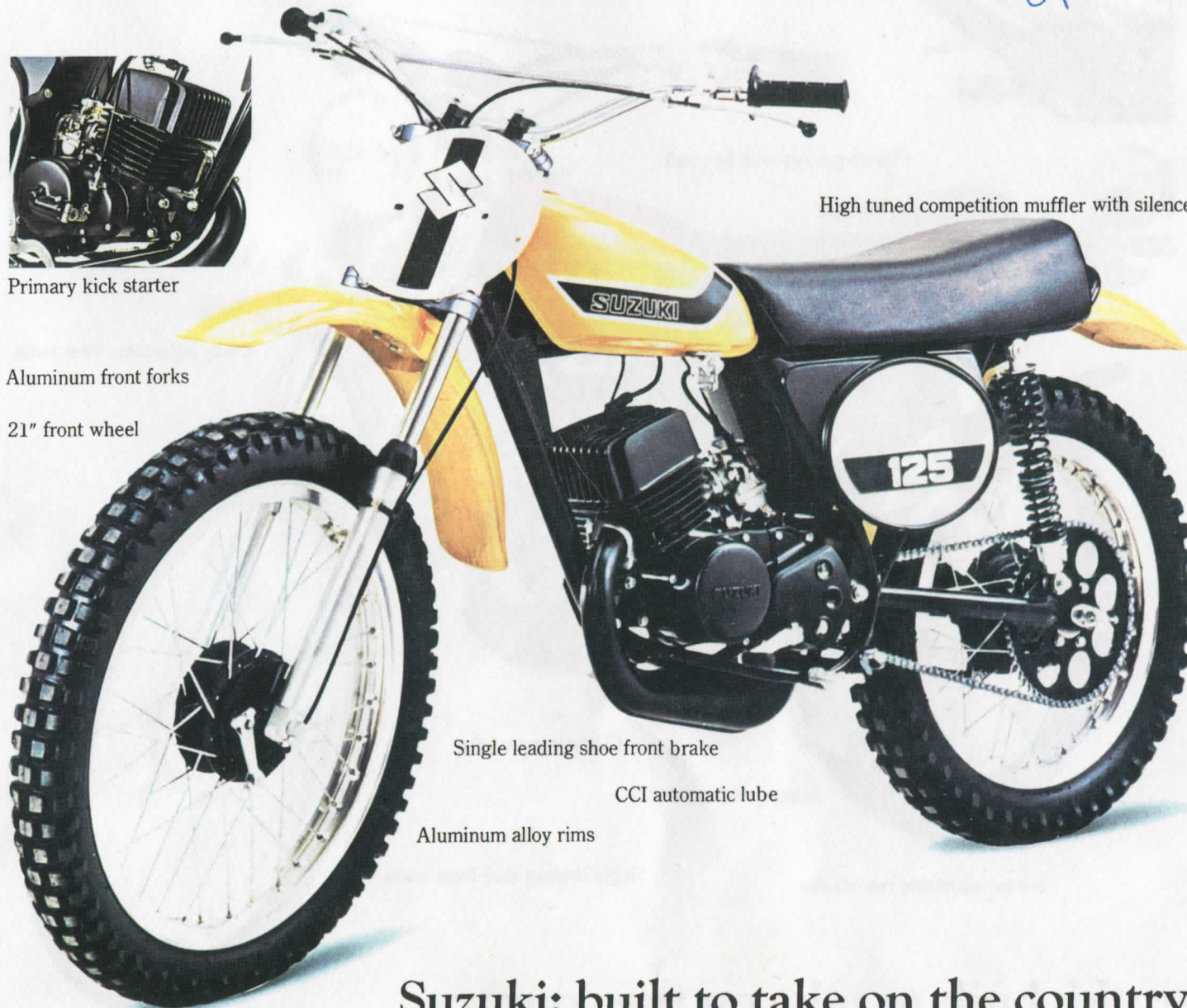
High tuned competition muffler with silencer