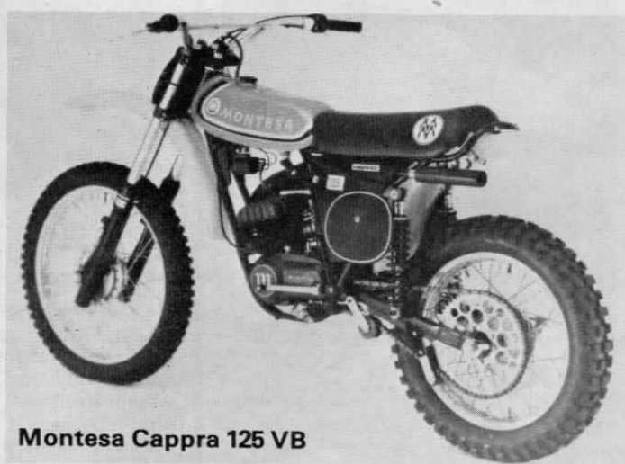
Montesa Cappa 125 VB