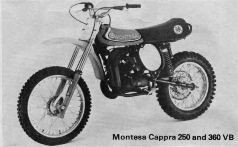
Montesa Cappra 250 and 360 VB