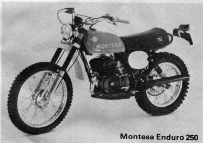
Montesa Enduro 250