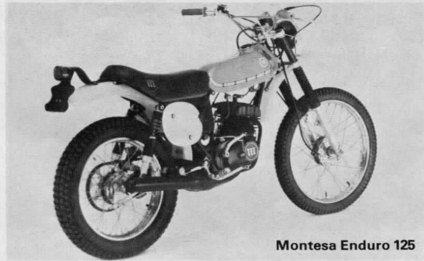
Montesa Enduro 125