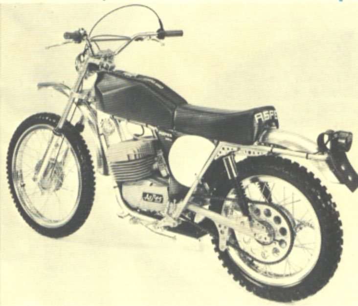
19 Horsepower/9:1 Compression ASPES ENDURO 125 CC