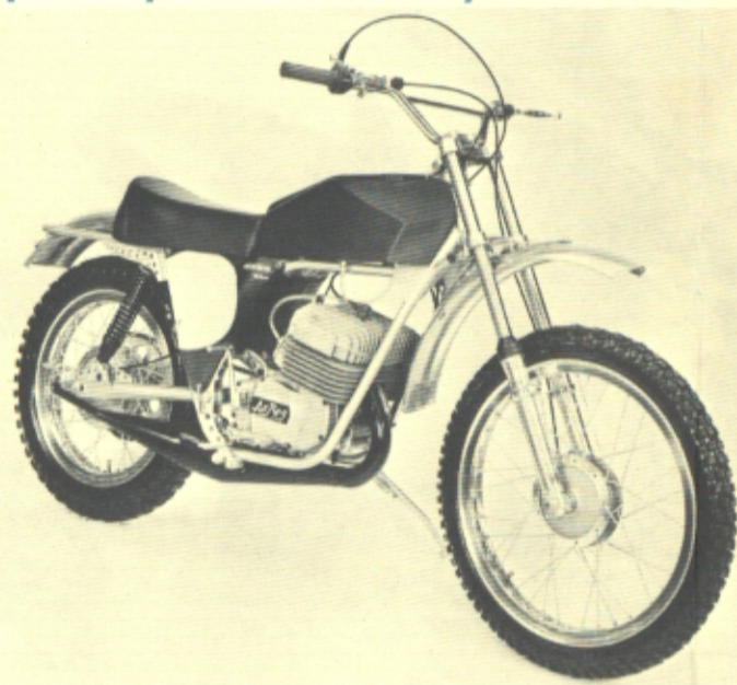
24 Horsepower/11:1 Compression ASPES CROSS 125 CC