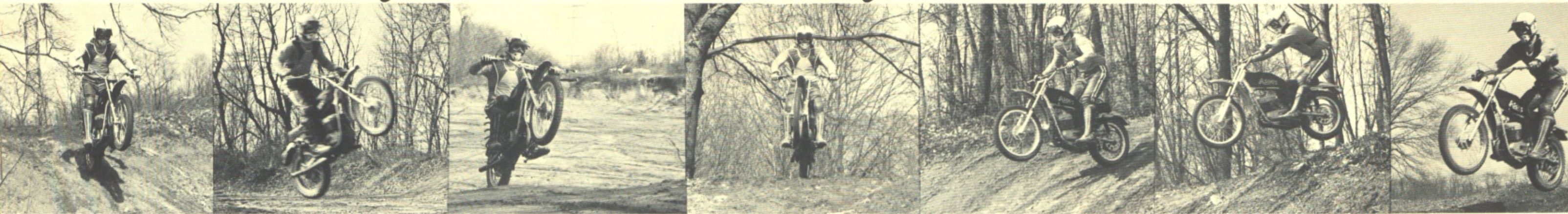
As-pes (as' peas) n. Championship 125 cc motorcycle. Born on the Continent, educated in the woods. Speaks "winning" fluently.

If you're thinking about a 125 cc Championship this year, better order your Aspes now!